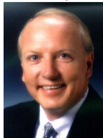
MARK VICTOR HANSEN Co-creator, Chicken Soup for the Soul